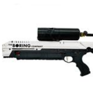
Elon Musk Sells