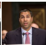
What Is Net Neutrality