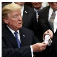
Trump to Send