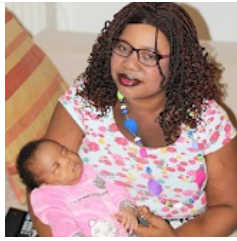
Wife rants on Facebook after receiving insults from hubby's babymama