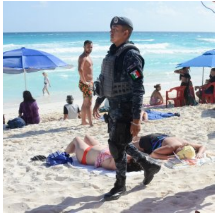
Cancun Has a Major Murder Problem