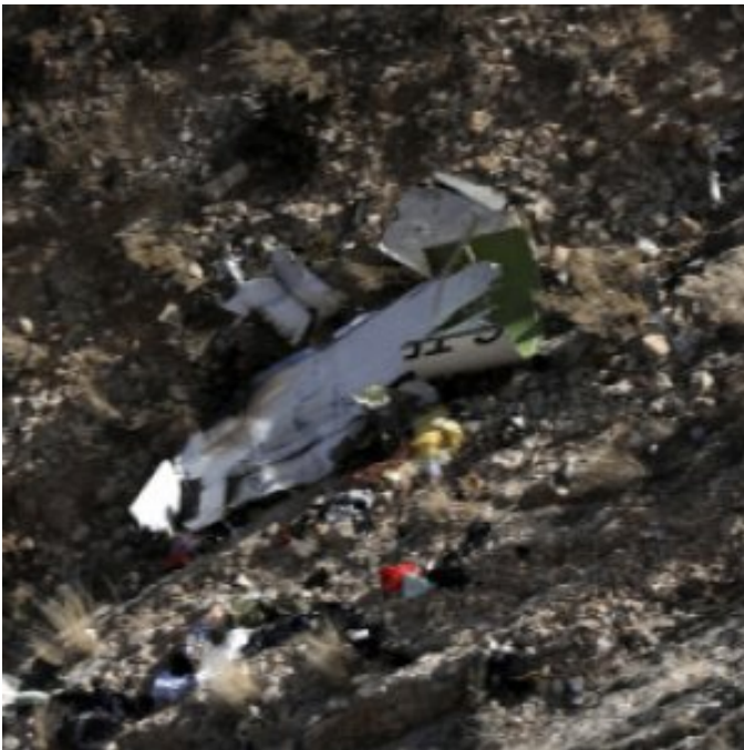
Private Plane Carrying Bachelorette Party Crashes