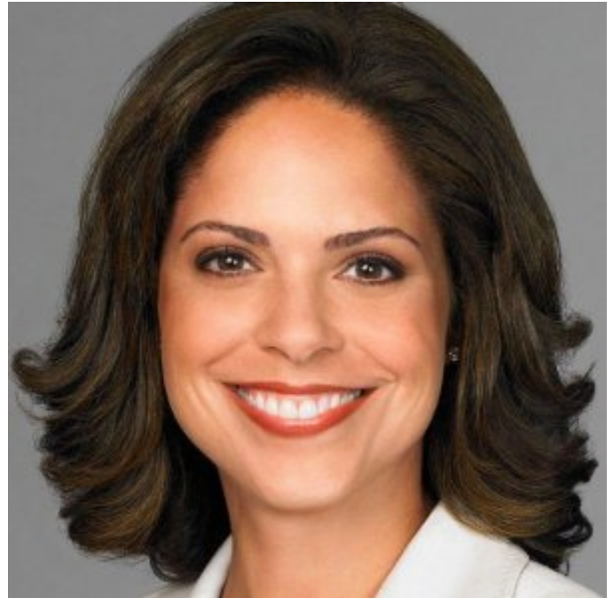
Ex-CNN Anchor Soledad O'Brien Blasts Former Network on Twitter