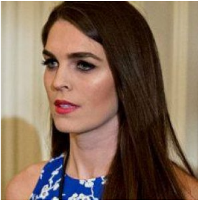
This May Be the Real Reason Hope Hicks Left Her White House Job