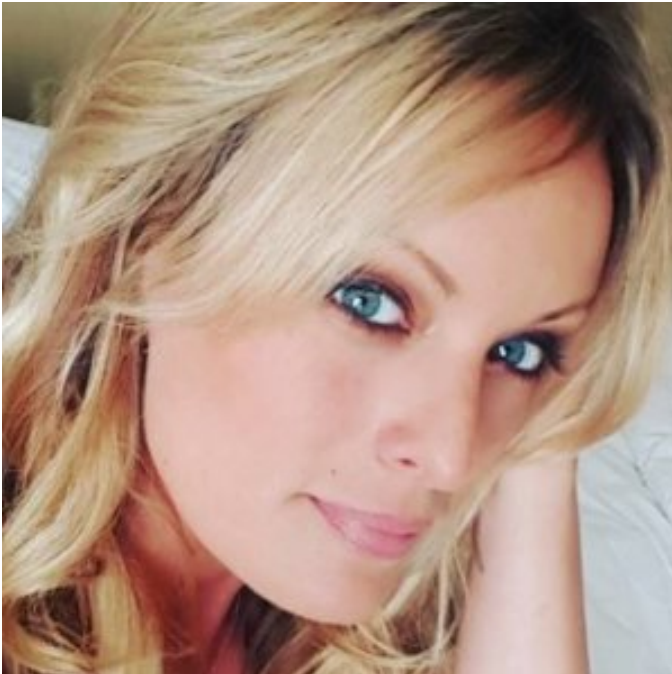
The Untold Truth of Stormy Daniels