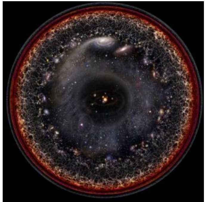
This Is What the Entire Known Universe Looks Like in One Image